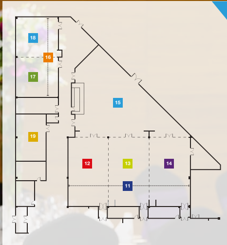
floor plan – orbiter conference centre

versatile and configurable meeting spaces to suit all requirements